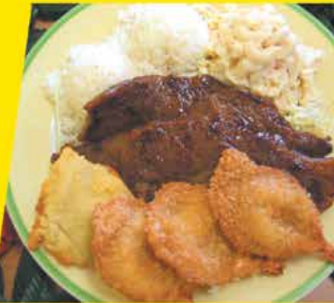
Seafood Combo with Short Rib