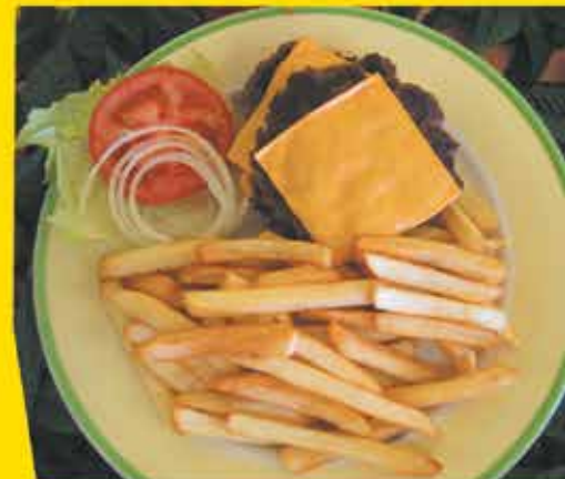
Double Cheese Burger French Fries