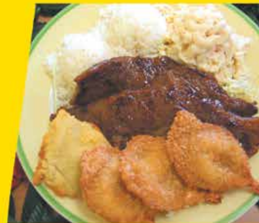
Seafood Combo with Short Rib