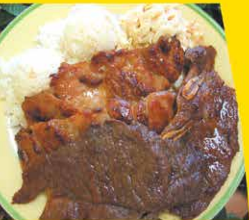
B.B.Q. Mixed Plate